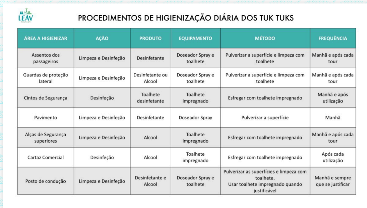
TABLE OF DISINFECTION AND HYGIENE PROCEDURES

This table, in addition to being an integral part of this manual, for better perception and compliance with the procedures, is exposed in the Cleaning, Hygiene and Disinfection area of the company's garage.